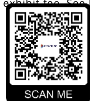
Exhibit support services needed: _____ Electrical outlet _____ Hardwire Ethernet Line Order these support services directly from the hotel via this link or scan this QR code.

NOTE: Booth assignments will not be made until payment is received. Multiple booths each require the exhibit fee. See last page for booth locations.