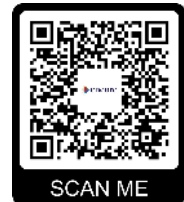
Exhibit support services needed: _____ Electrical outlet _____ Hardwire Ethernet Line Order these support services directly from the hotel via this link or scan this QR code.

NOTE: Booth assignments will not be made until payment is received. Multiple booths each require the exhibit fee. See last page for booth locations.