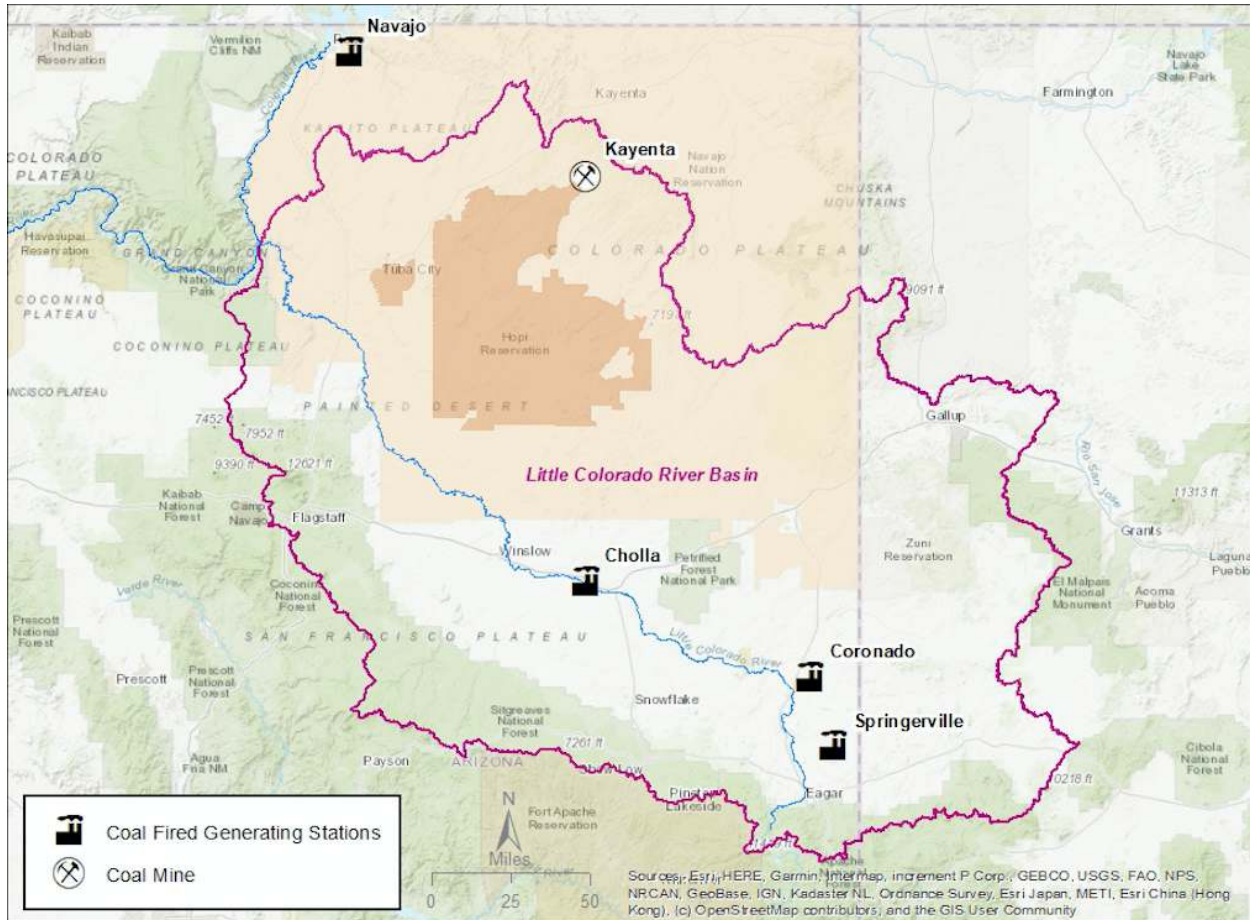
Figure 1. Mines and generating stations in the LCR watershed among a multijurisdictional patchwork of territories including the Hopi and Navajo Reservations and Grand Canyon National Park. (Map by: James Major)

water supply with the industrial sector being the largest user. From 2001-2005, industry accounted for 49 percent of all water demand, two-thirds of which was met by groundwater and used primarily for energy production at the stations indicated in Figure 1 (ADWR 2009). Though tribal lands comprise 63.9 percent of the EPAA, tribal water demand is approximately ten percent of overall demand. This disparity in consumption rates is exemplified by Peabody Western Coal Company (PWCC), which in 1968 began pumping over 3.8 million gallons per day from the Navajo aquifer to slurry coal to Mohave Generating Station. Before Mohave closed on December 31, 2005, PWCC pumped approximately 4,400 acre-feet of water per year (AFA). 1 Withdrawal reduced to 1,235